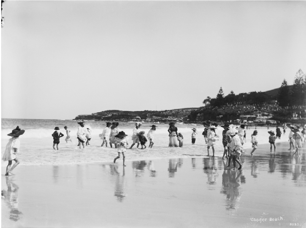
Image: Coogee Beach